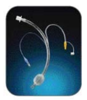
* Hi-Lo Evac Tube

Although there is evidence to suggest there is a benefit due to subglottic secretion drainage, uptake of the practice in routine care has been slow (4). One study from 2003 found that nurses performed subglottic secretion suction only 17.6% of the time(4). A study from 2000 surveyed the critical care practice of Canadian and French university-affiliated hospitals and found that less than 5% reported performing continuous aspiration of subglottic secretions(1). Currently, the American